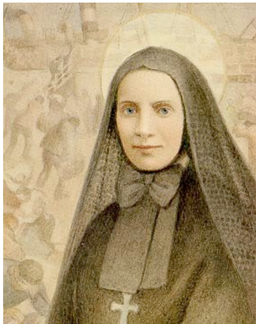
Saint Frances Xavier Cabrini